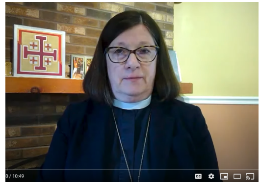
Rev. Elizabeth Eaton, Presiding Bishop of the ELCA; June 7, 2020 ~ Holy Trinity Sunday

around today, he may even point to them as evidence of the ‘fruits of the Spirit.’ In fact, faith itself -any hint, whisper or display- faith itself is God’s miracle among us! One thing we may celebrate together in the midst of all this chaos is something parallel to it: a growing sense of interdependence. Again, this is seen in so many ways. One way that it may be observed is through those ways the Bishop and her office have sought to stay connected with all of our synod’s congregations and leaders. It is also a goal (i.e., being interdependent and caught up in an awareness of mutual conversation and consolation) lived out by the various worship opportunities provided from our NJ Synod Bishop’s office as well as the church wide office of the ELCA. These worship services, sermons, and words of accompaniment and encouragement have been offered to our constituent congregations